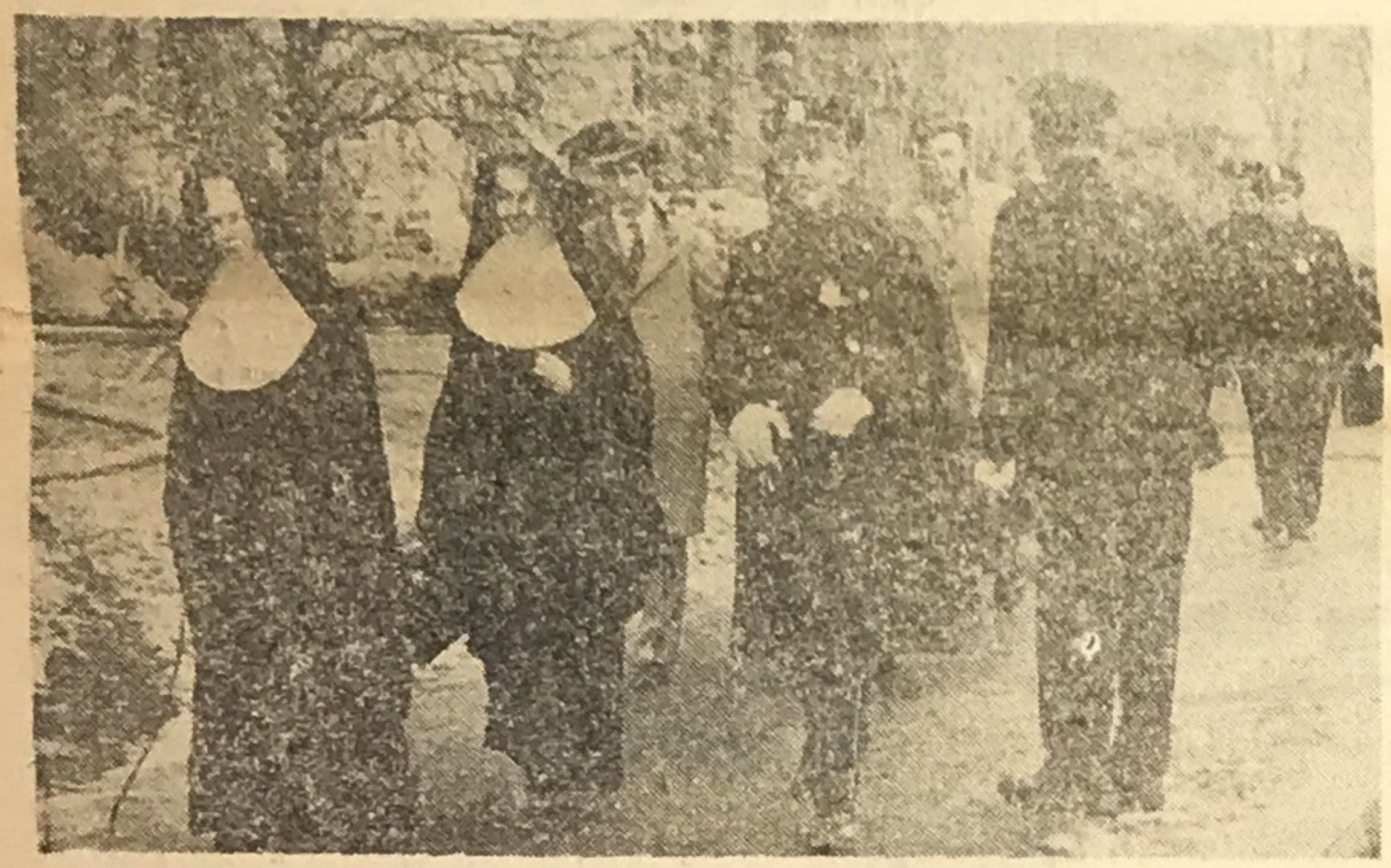
NUNS LEAVE CONVENT: As a precautionary measure in the face of threat from the blazing church next to their convent nuns of

the Sisters of Mercy leave with some of their belongings for safer quarters.