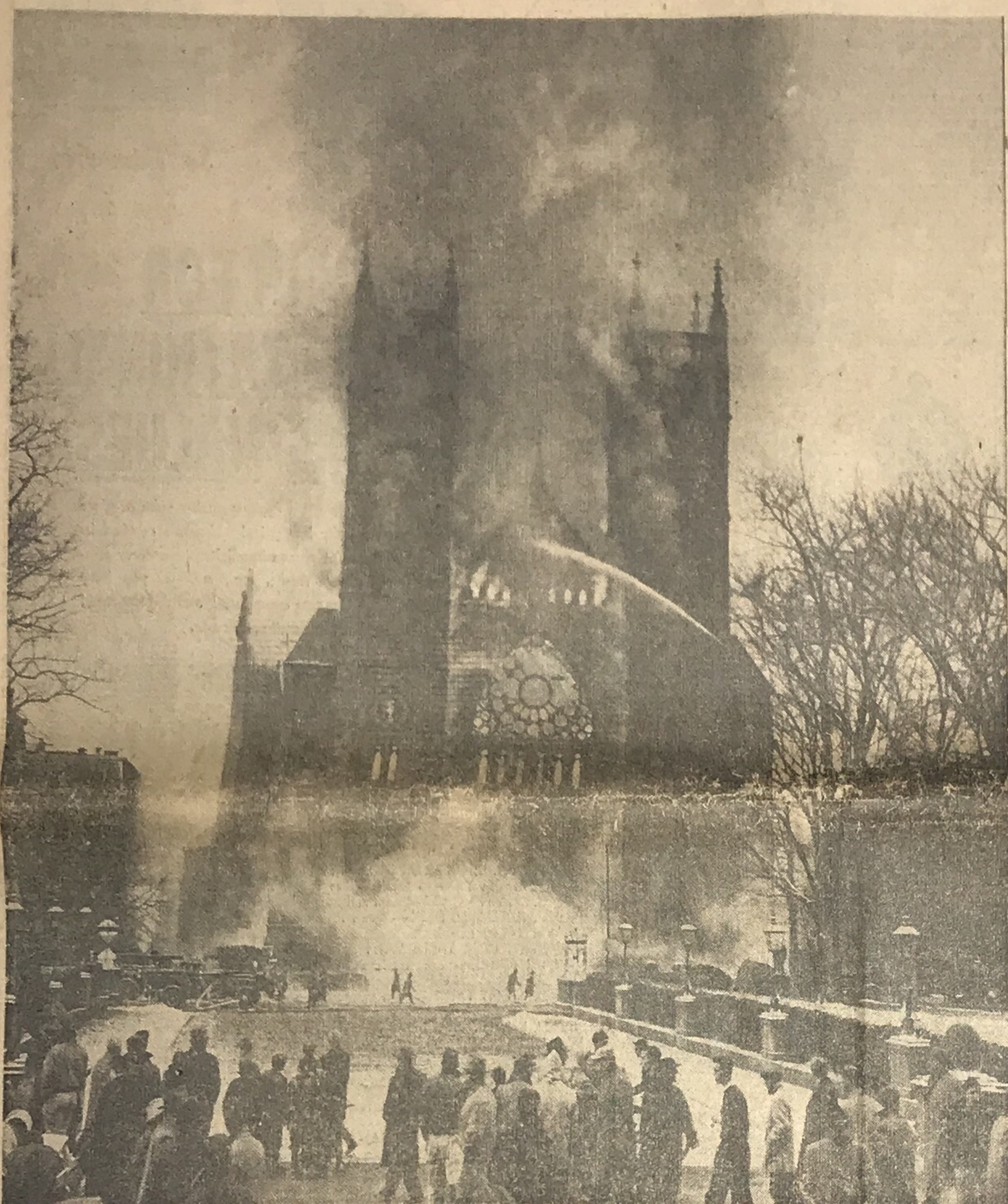
FLAMES DESTROY CATHOLIC LANDMARK: St. Joseph Cathedral during the height of the blaze which turned largest Connecticut Roman Catholic Church into a raging inferno. Thousands were attracted to the scene which roared uncontrolled until noon.