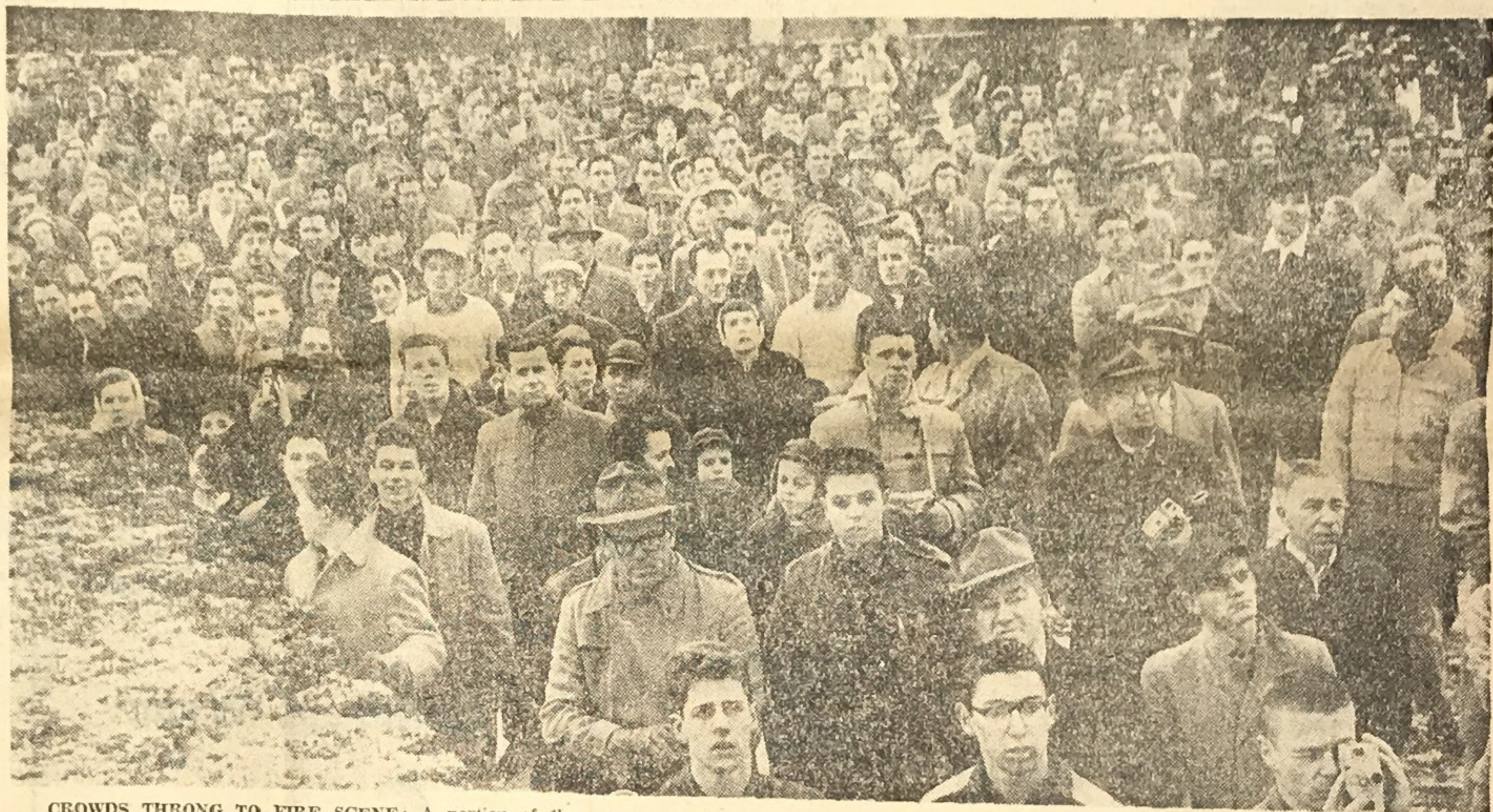
CROWDS THROG TO FIRE SCENE: A portion of the crowds of sightseers, many armed with still and movie cameras, who appeared at the scene of the spectacular fire. As word of the blaze spread police had a fulltime job in barricading surrounding streets and breaking up traffic stalls.

the Sisters of Mercy leave with some of their belongings for safer quarters.